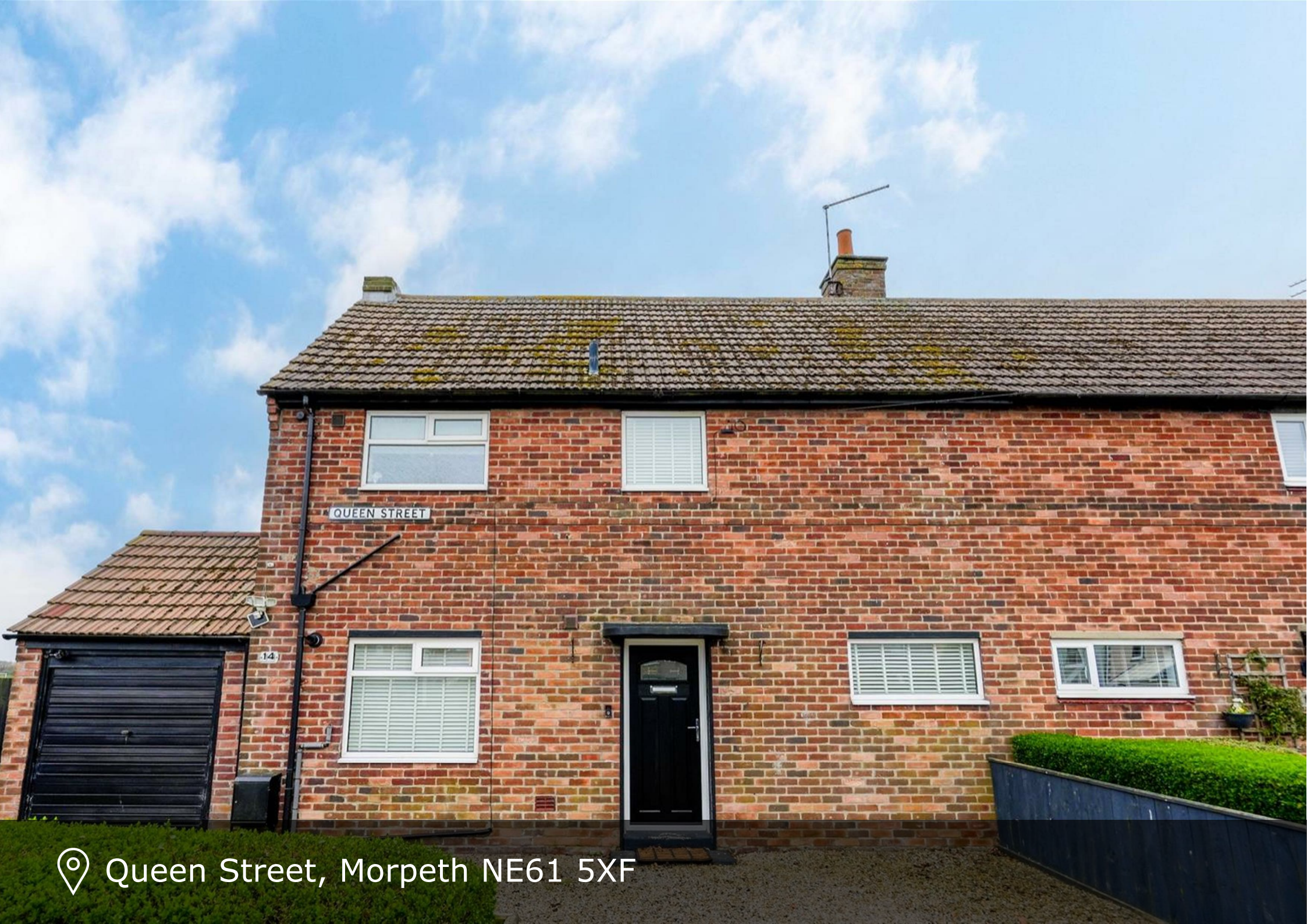
📍 Queen Street, Morpeth NE61 5XF